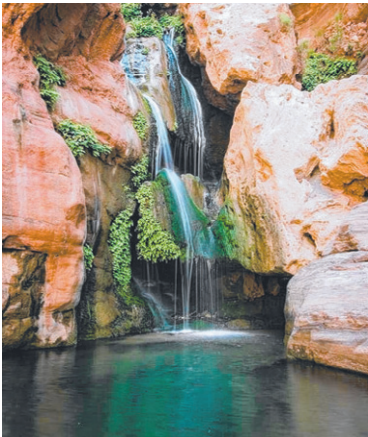
BEAUTY SPOT: Rafting down the Colorado (top); and lovely Elves Chasm waterfall (above).